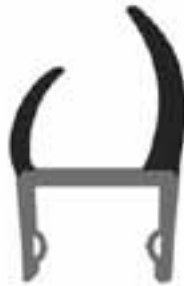
VINYL DOOR MOULDING 168.00"