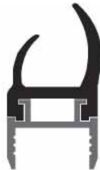
TRU-SEAL VINYL MOULDING