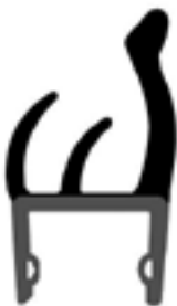
TRU-SEAL VINYL MOULDING